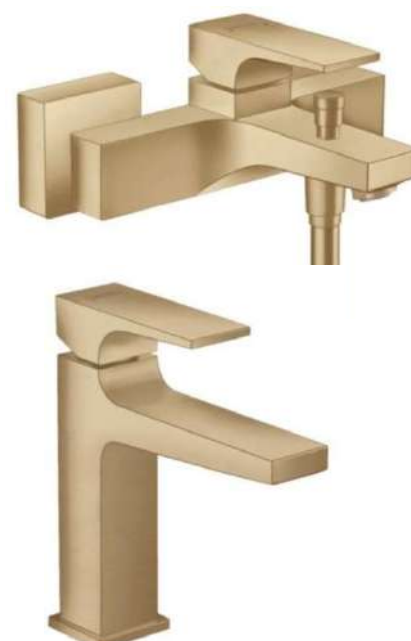
Secondary bathrooms taps.