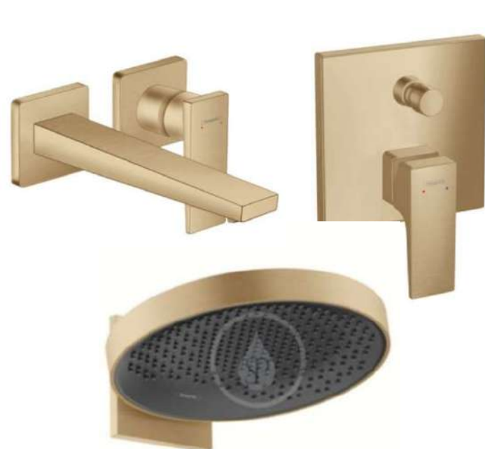
Master Bathroom Taps

Backlit mirrors Fanti-slip floor integrated shower tray. Full size sliding shower screen. Wall mounted toilet, concealed in wall tank, dual-flush actuator medium and complete discharge. Soft close toilet seat.